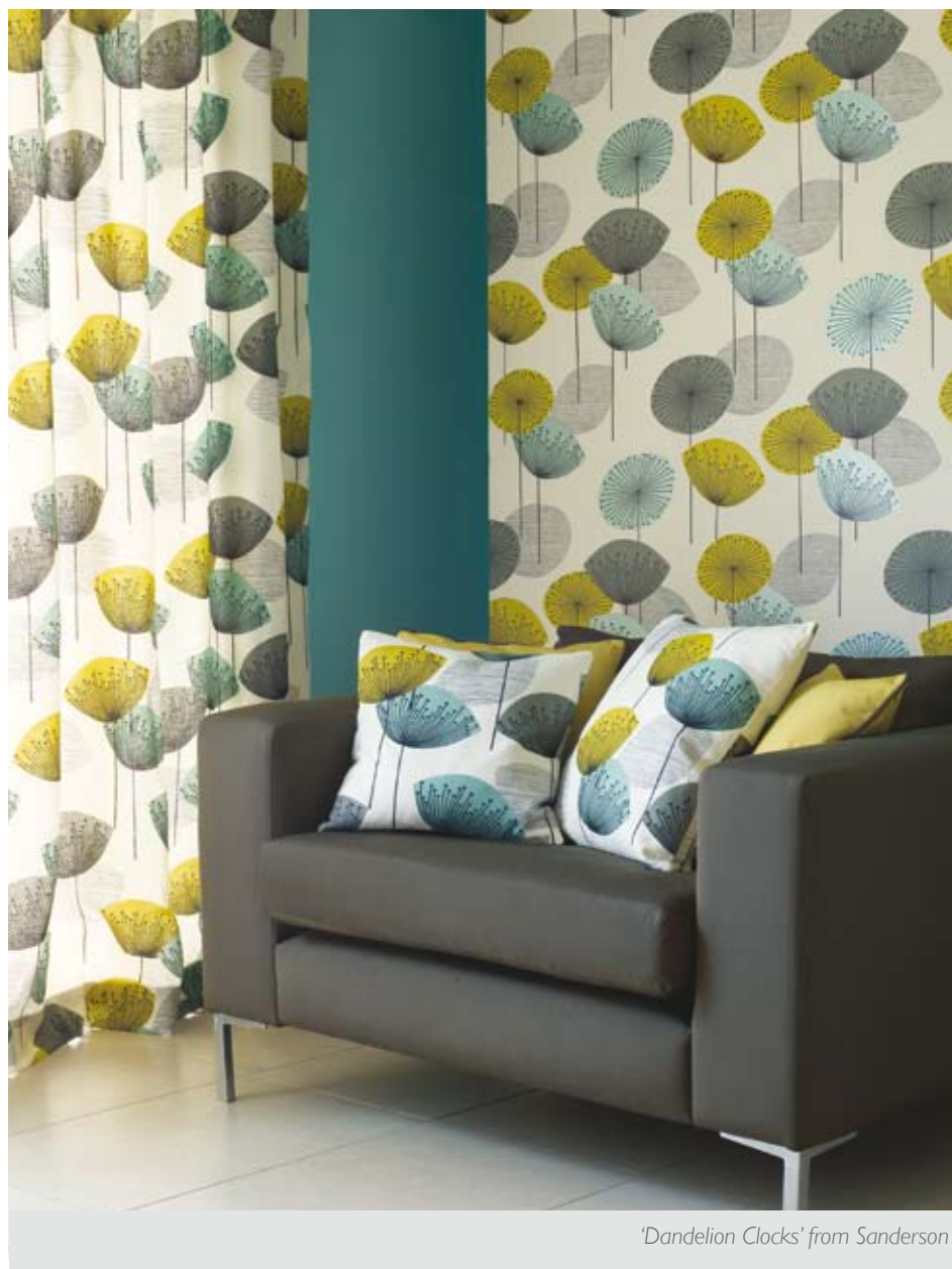
'Dandelion Clocks' from Sanderson

resurgence in the vintage and retro look. Sanderson launched 2 collections last season, one featuring archive material and the other 'Dandelion Clocks' that proved to be very popular.